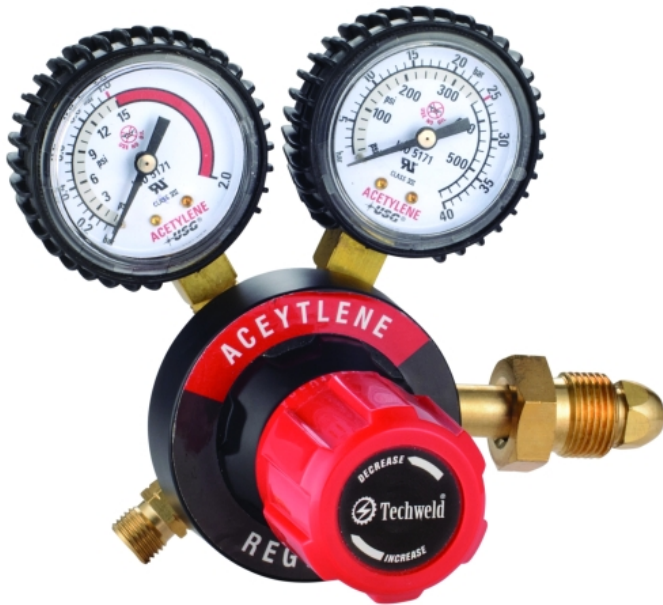
Part no - 30GE-REG-ACT-TRA002

Inlet pressure – Air @ 70 degree Fahrenheit